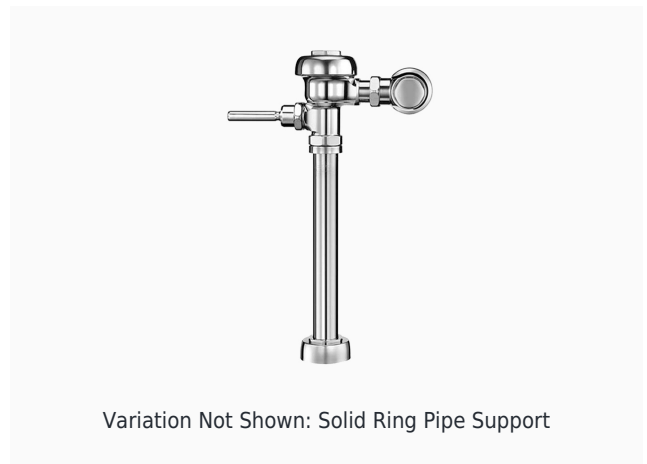
Variation Not Shown: Solid Ring Pipe Support